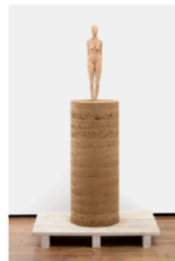
Prune Nourry Venus (Ozanna), 2024 Bronze, earthen skin patina 14 × 62 × 12 cm