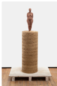
Prune Nourry Venus (Maria), 2024 Bronze, earthen skin patina 18 × 57 × 13 cm