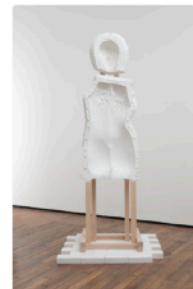
Prune Nourry Venus hybride #3, 2024 Moulds on wood (oak) and brick structure 65 × 211 × 35 cm