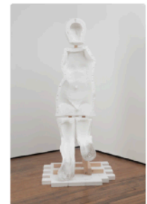
Prune Nourry Venus hybride #5, 2024 Moulds on wood (oak) and brick structure 65 × 233 × 40 cm