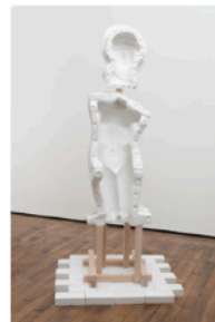
Prune Nourry Venus hybride #2, 2024 Moulds on wood (oak) and brick structure 58 × 215 × 35 cm