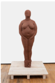
Prune Nourry Venus (Louise), 2024 Bronze, earthen skin patina 65 × 165 × 40 cm